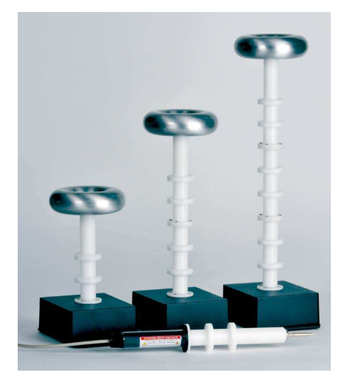
HVL Series High Performance Lab Grade, HV-SmartProbes™ shown above in 35KV, 70KV and 100KV models. Handheld HVP-35 portable HV-SmartProbes™ shown with detachable probe tip.

Vitrek's 4700 precisely measures voltages directly up to 10KV, right out of the boxwith no external probes. That's high enough for most of the HV sources out there. However, should you care to expand your high voltage measurement range-just add one or more of the available 35KV, 70KV, 100KV and 150KV SmartProbes™. The Vitrek SmartProbes<sup>™</sup> each store their own calibration data which is down loaded when they are plugged in to the 4700-this results in high accuracy, calibrated readings and allows any Vitrek SmartProbe™ to be used with any 4700 HV Meter. The SmartProbe's™ proprietary, ultra-low TC attenuator design minimizes self-heating-while its low capacitance technology enhances AC