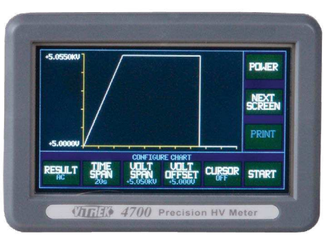
Chart Mode automatically plots voltage readings from a few seconds to several days. Highly useful for determining ramp linearity, overshoot and sag on hipot testers and other HV sources.

Automate your HV test requirement with the 4700's built-in Ethernet port, high speed serial communication port or available GPIB. The 4700 is fully programmable—so you can select your measurement mode and bandwidth, then take readings as often as desired. The 4700 also comes standard with a USB printer port, to capture readings and get hardcopy printouts of HV plots—so you can document the sag or overshoot in a typical hipot test.